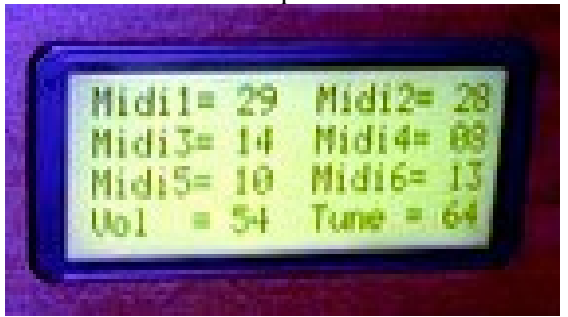
Illustration 10: Liquid Crystal Display

Artisan Instruments makes available a 4-line by 20 character LCD display that can be controlled by the Micro-MIDI system. To control this display, a dedicated Micro-MIDI module is required. This module should be placed in the MIDI stream after any inputs to which it must respond.