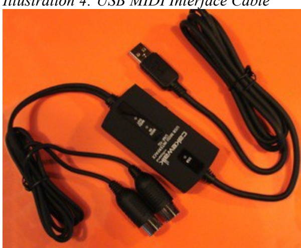
Illustration 4: USB MIDI Interface Cable

If a computer is not capable of MIDI I/O, a number of USB to MIDI interfaces are available commercially.