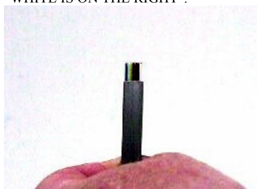
Illustration 7: 6 Strand Cable

4) Crimp the connector tightly with the crimping tool. This method provides the proper orientation for the cables when plugged into the receptacles on the Micro-MIDI board(s) and the various other boards. In effect, it provides the 180 degree twist in the cable ---- which is correct. The cables can now be plugged into the appropriate RJ-11 jacks. When connecting multiple boards to one Micro-MIDI module, the cable should go from the Micro-MIDI module to the IN connector on the first board. Subsequent boards are wired using cables between the NEXT connector of one board and the IN connector of the next board.