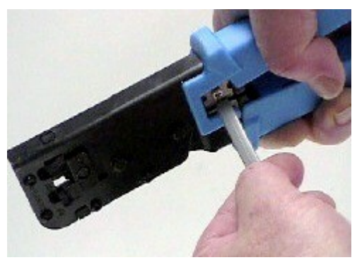
Illustration 8: Crimping Tool