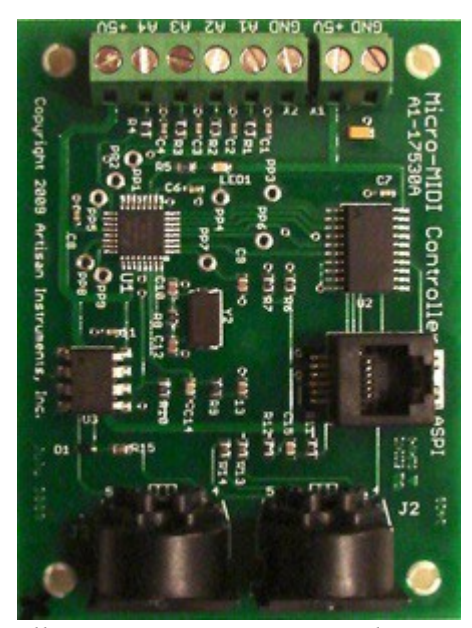
Illustration 2: uMIDI Board

Pots (controllers) may be connected either to HV-64 boards or directly to the Micro-MIDI board. Up to four pots may be connected to a Micro-MIDI board. (Note: Early Micro-MIDI boards did not allow this.) Up to seven pots may be connected to one HV-64 board; connecting n pots will use n+1 inputs on that board.